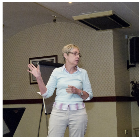
Above and Left: Photographs from Workshops